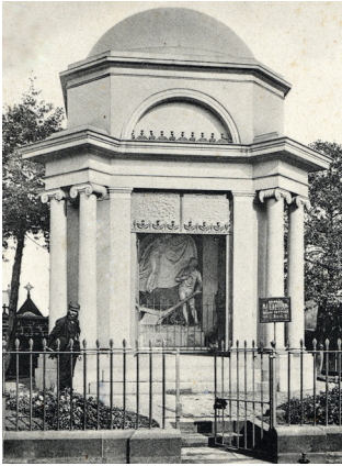
The Burns mausoleum, from a postcard of 1905, showing the sculpture within by Peter Turnerelli (1771/2-1839) featuring Burns at his plough (image courtesy of © the Dumfries Museum, BUR/239).

Subscriptions are invited to raise sufficient funds so that this important project can be realised. Names of Subscribers will be printed within the book if desired.