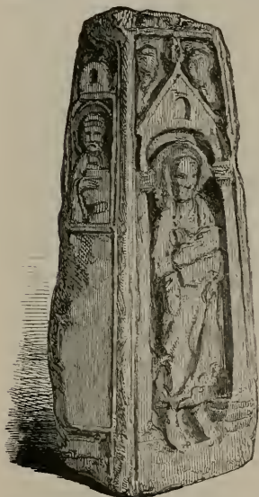
Fig. 1. Sculptured Cross Shaft from Hoddam. p. 12.

Kentigern 1 . It is of fine red sandstone, and measures two feet in height, nine and a half inches broad at the base, and is six inches thick. On the front of the stone is a draped figure standing under an arched pediment, having a nimbus, and holding a book in the right hand. Above the pediment are the heads of two figures, much defaced, probably of angels. On each of the sides is a half-length figure of a saint, each with nimbus and book. The back of the shaft has also been sculptured, but the carving has been nearly all chiselled or worn away. On the lower part, however, the outlines of two human figures can be made out. In all probability this portion of cross-shaft is of contemporary date with the famous