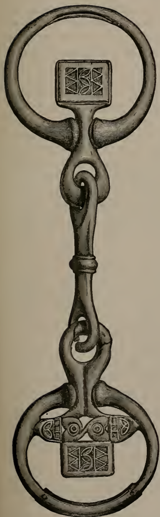
Fig. 2. Enamelled Bridle-Bit from Birrenswark.

The bronze bridle-bit here described was presented to the National Collection in 1785 by Dr Robert Clapperton. The mouth-piece of the bit is in one piece, and measures only 3\frac{1}{4} inches in length, while the cheek rings are 2\frac{11}{16} inches in greatest length, by 2\frac{1}{2} inches across. The outer part of each ring is considerably worn by use, and a narrow strip of metal has been neatly riveted on the under or inner side to strengthen them. The other loops have also been strengthened by thin plates of metal being wrapped round them. It will be observed that the ornamental design of each outer ring differs considerably. The decoration of the plates within the rings has consisted of champlevé enamel of different colours, alternating in alternative rows in the triangular and oval spaces, of which the red only